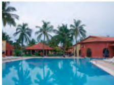
Gambia Hotel School