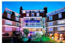
Stade Court hotel, UK